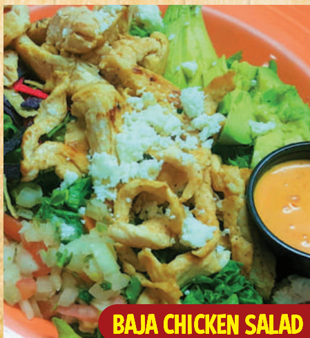
BAJA CHICKEN SALAD