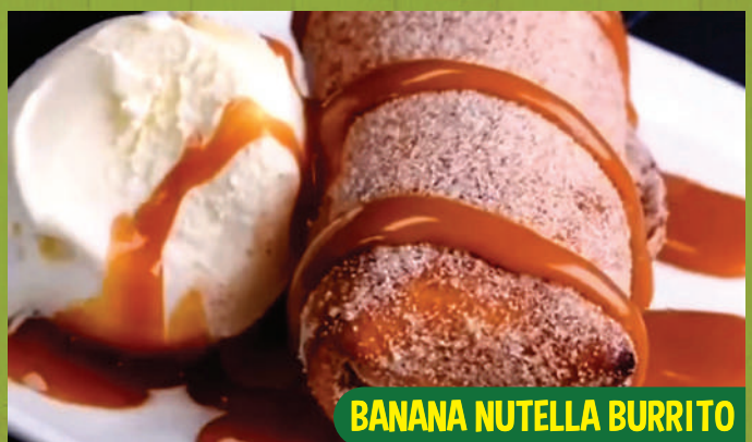
BANANA NUTELLA BURRITO

Flour tortilla filled with Nutella and fresh banana. Fried and tossed in cinnamon sugar and drizzled with dulce de leche. Served with vanilla ice cream. 5.99